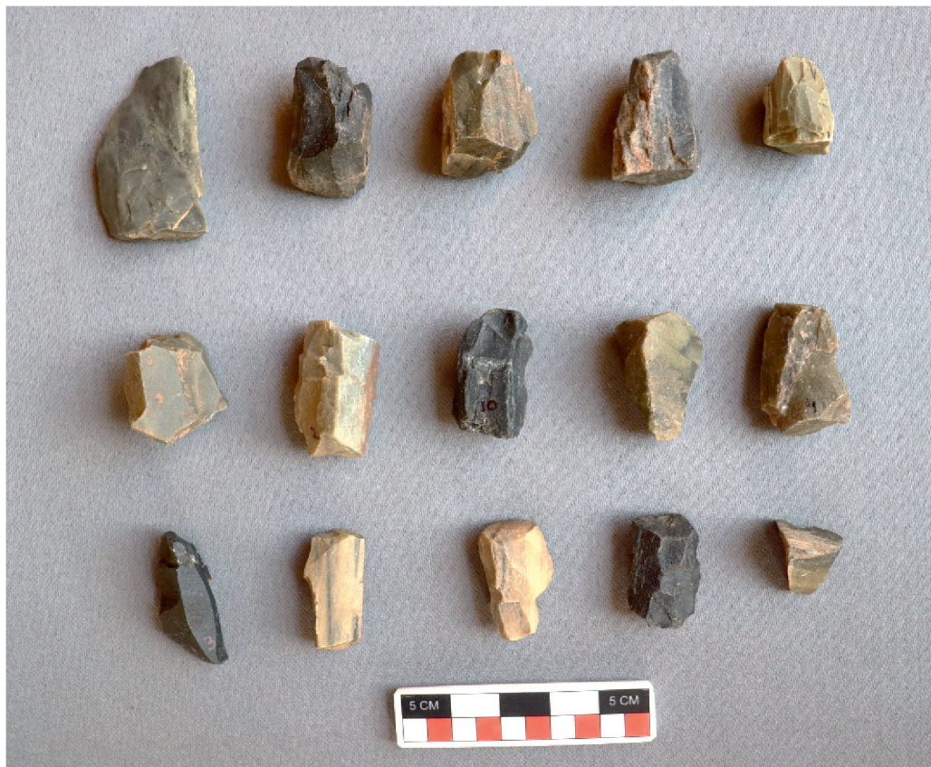
Plate 3: Microlithic Blade Cores found from the sites of Salandi river valley.