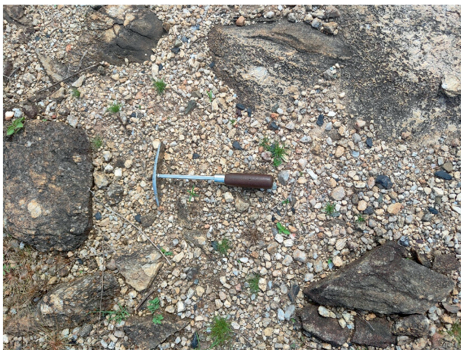
Plate 1: Close-up view of the microlithic artefact cluster at the Baruan-I site.