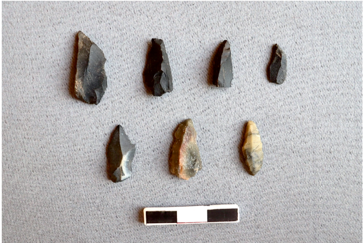
Plate 8: Microlithic Points recovered from the Sites of Salandi Valley.