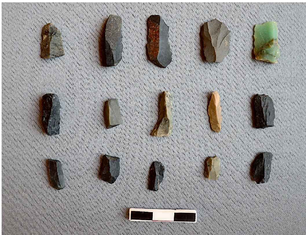
Plate 7: Different Varieties of Microlithic Blades recovered from the Sites of Salandi Valley.