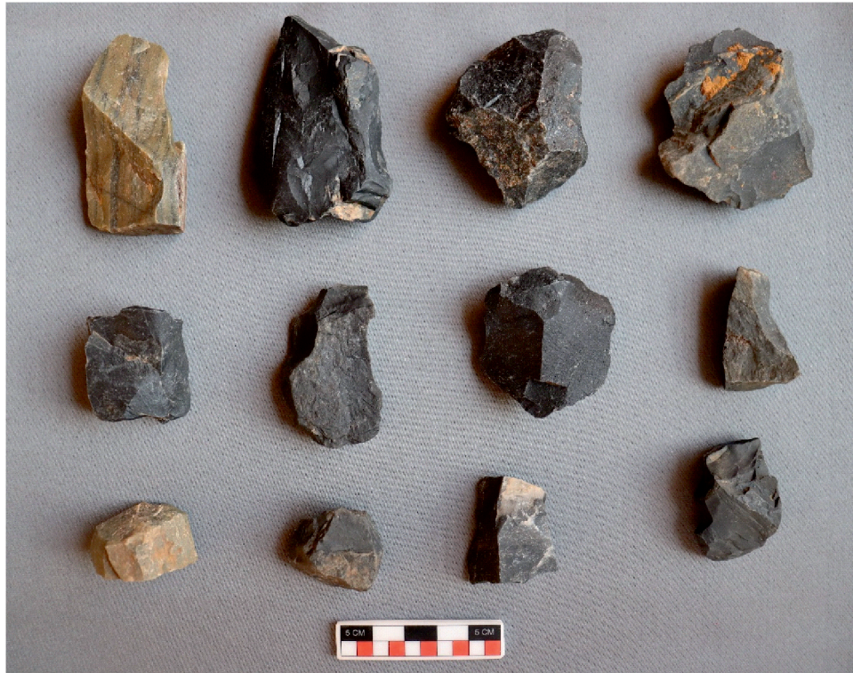
Plate 4: Microlithic Flake Cores recovered from the Baruan-I sites