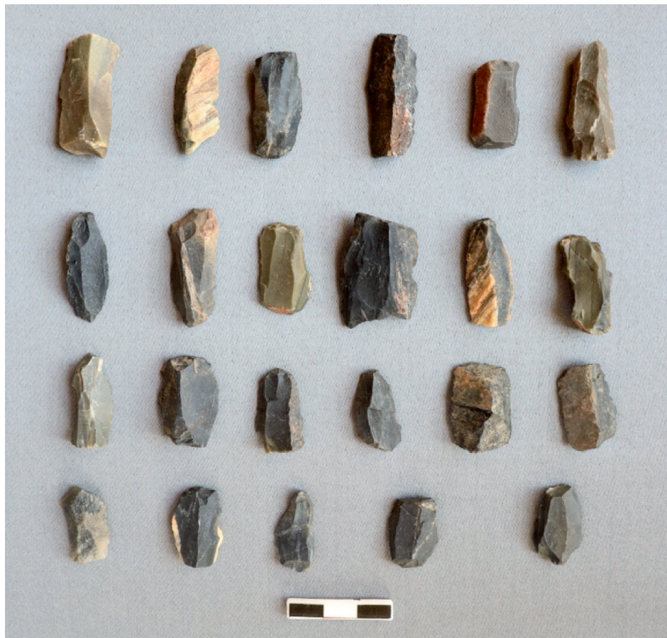
Plate 5: Microlithic Bladelets found from the sites of Salandi River valley.