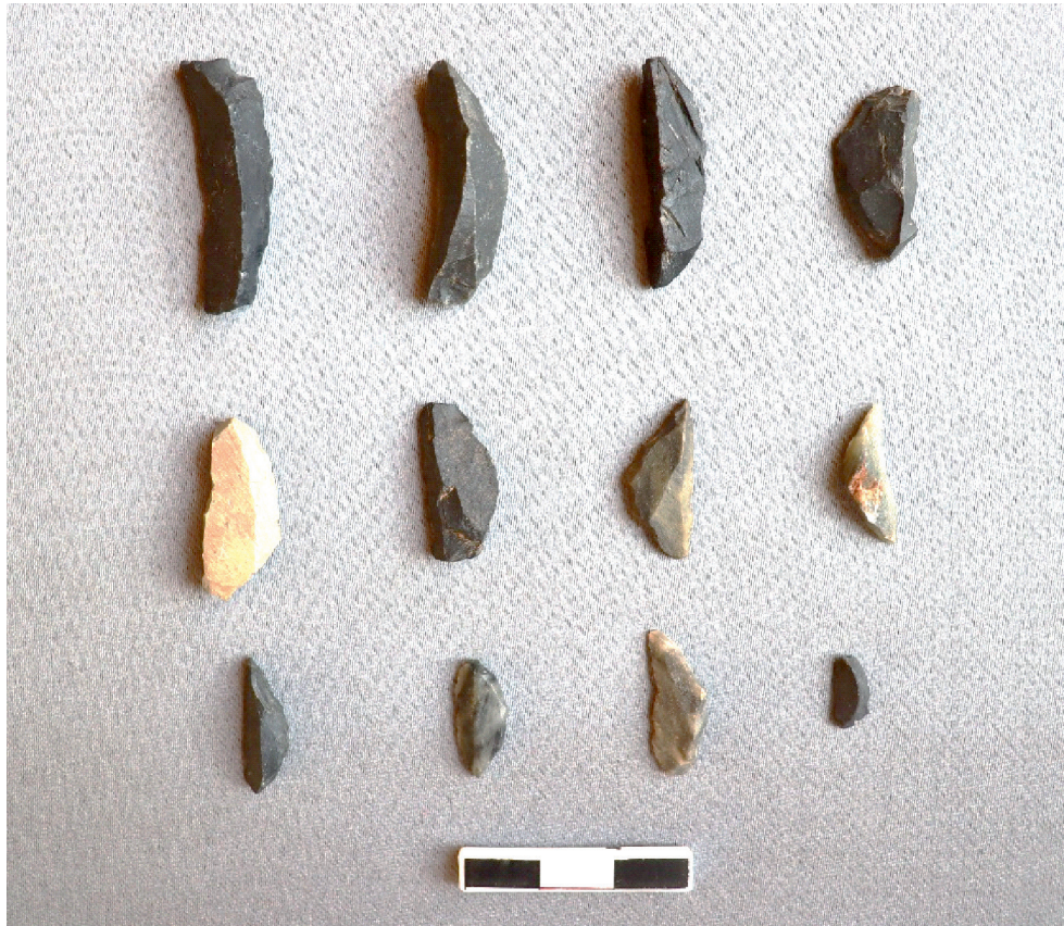
Plate 6: Different Varieties of Microlithic Crescents found from the Sites of Salandi Valley.