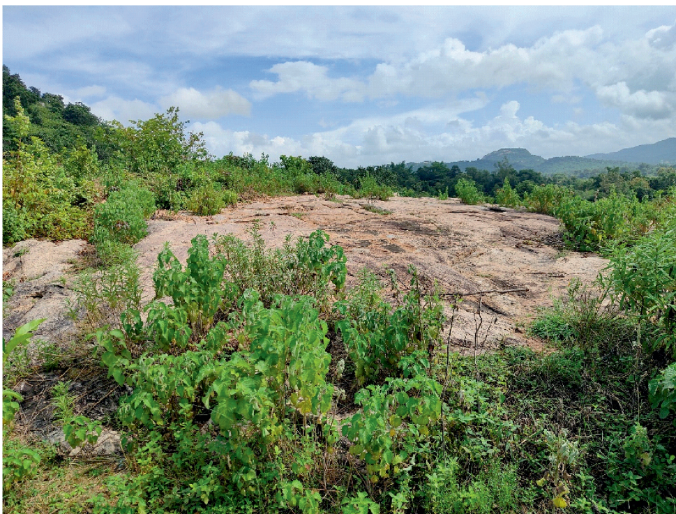
Plate 2: General view of the microlithic site of Baruan-II site.